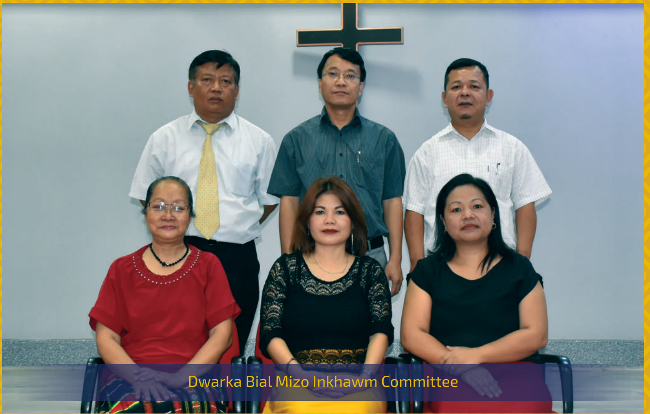
Dwarka Bial Mizo Inkhawm Committee