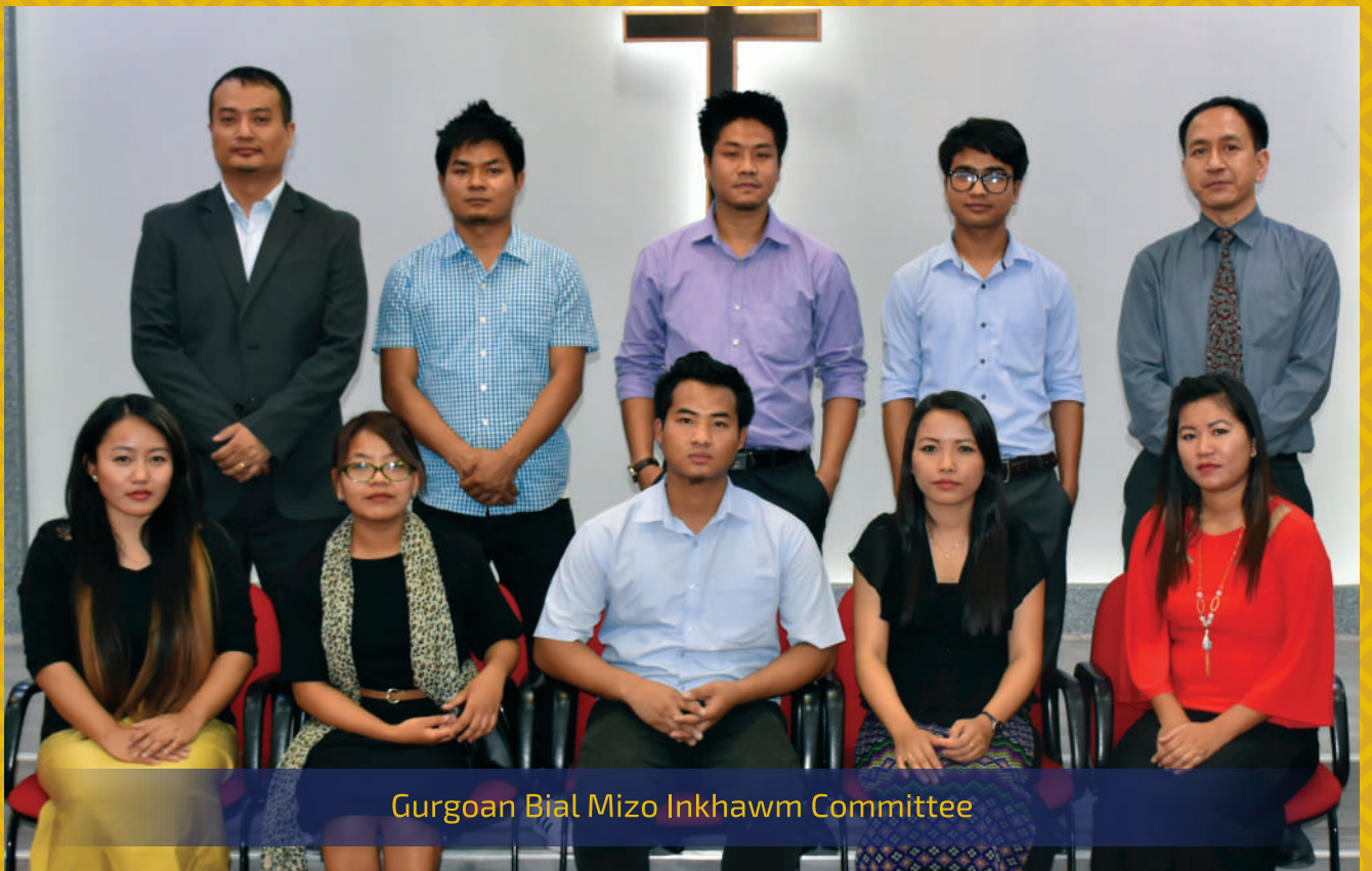
Gurgoan Bial Mizo Inkhawm Committee