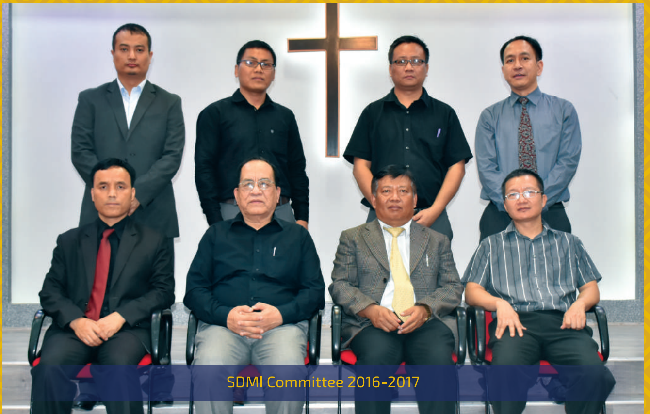
SDMI Committee 2016-2017