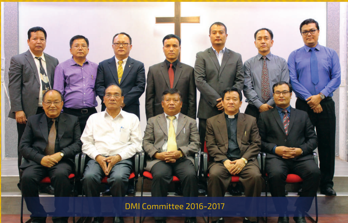
DMI Committee 2016-2017