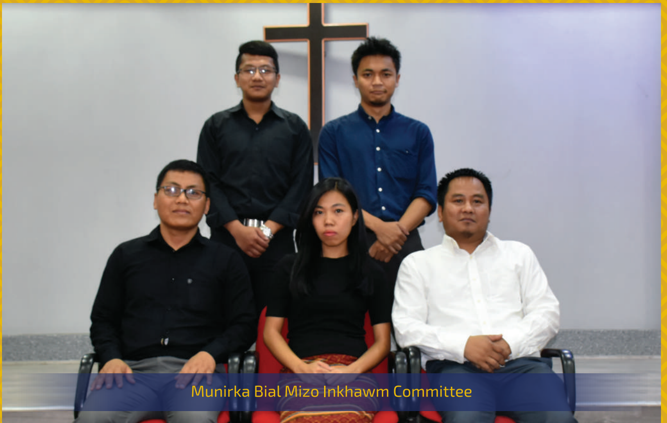
Munirka Bial Mizo Inkhawm Committee