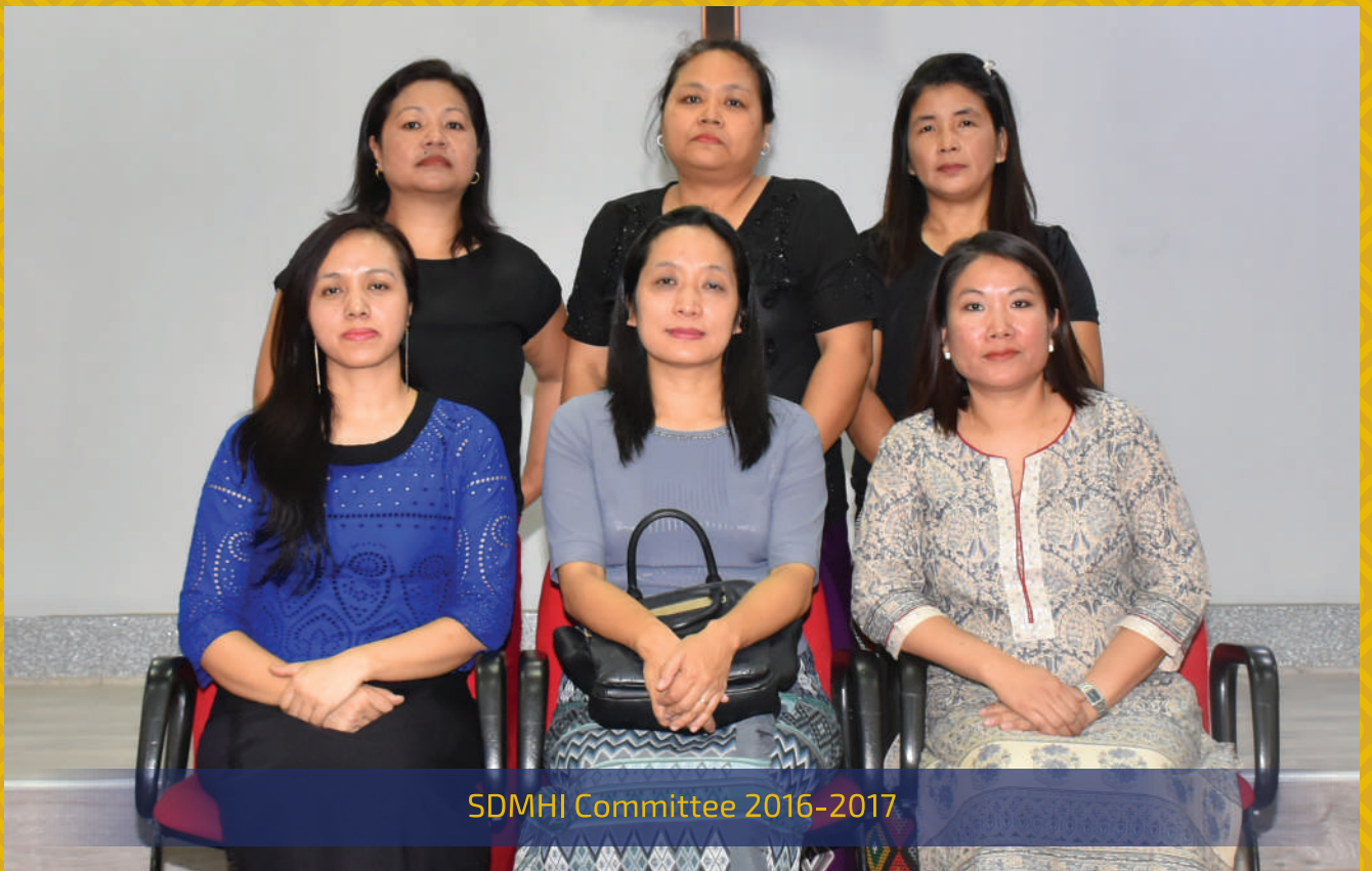
SDMHI Committee 2016-2017