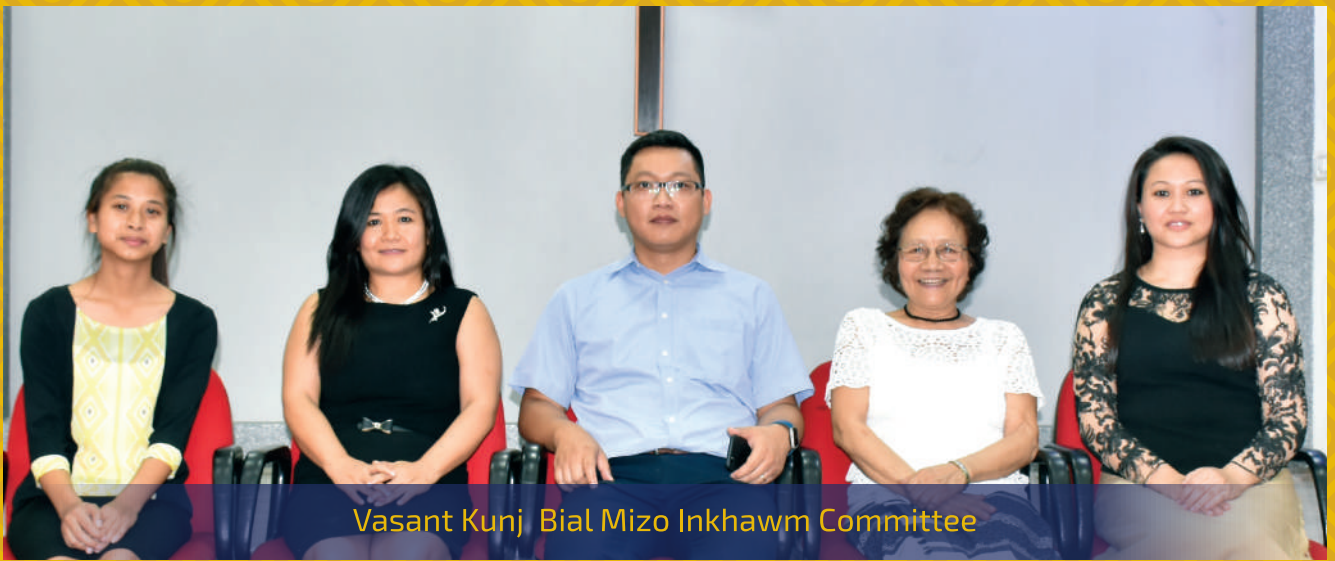
Vasant Kunj Bial Mizo Inkhawm Committee