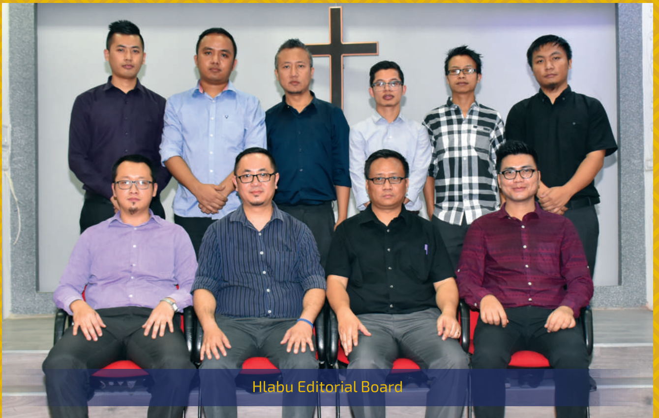
Hlabu Editorial Board