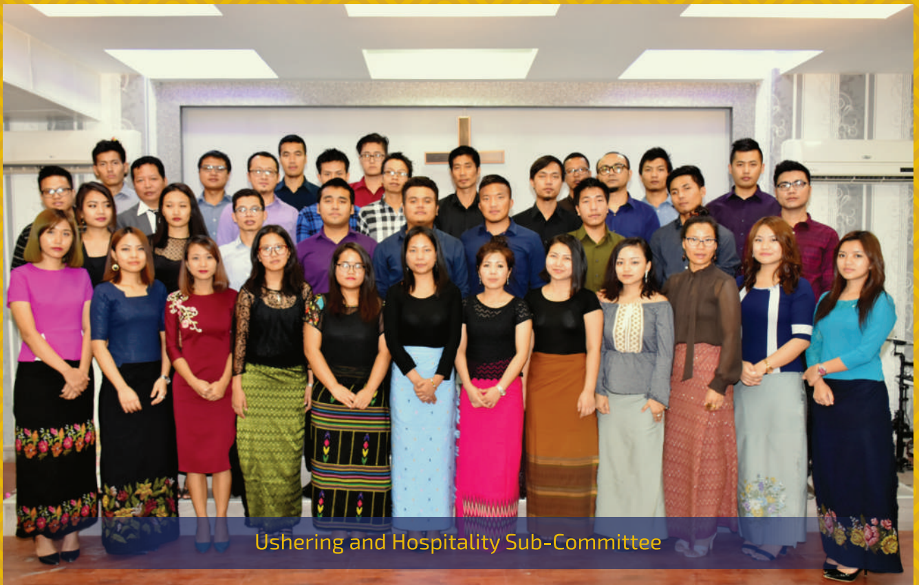
Ushering and Hospitality Sub-Committee