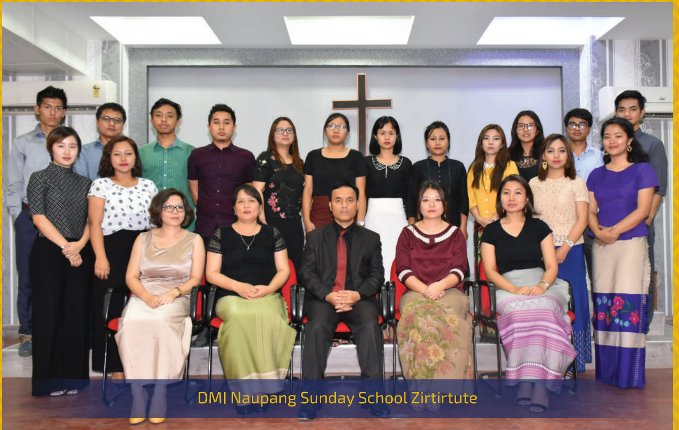
DMI Naupang Sunday School Zirtirtute