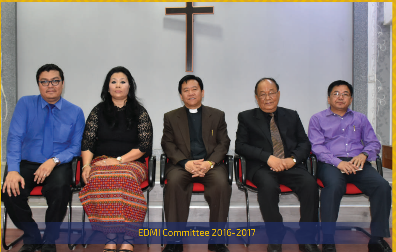
EDMI Committee 2016-2017