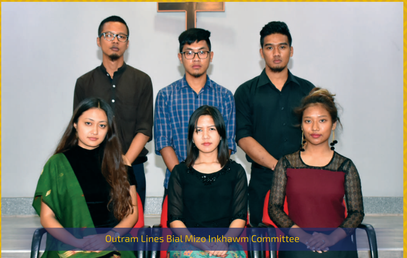
Outram Lines Bial Mizo Inkhawm Committee