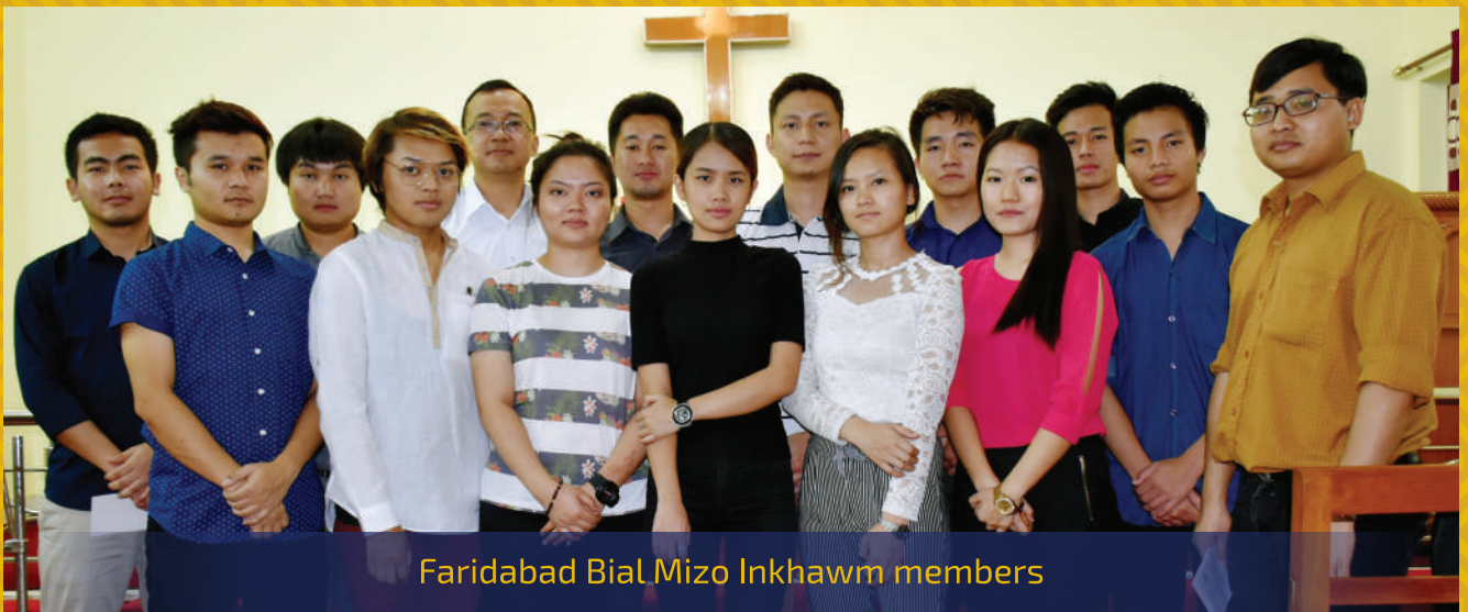
Faridabad Bial Mizo Inkhawm members