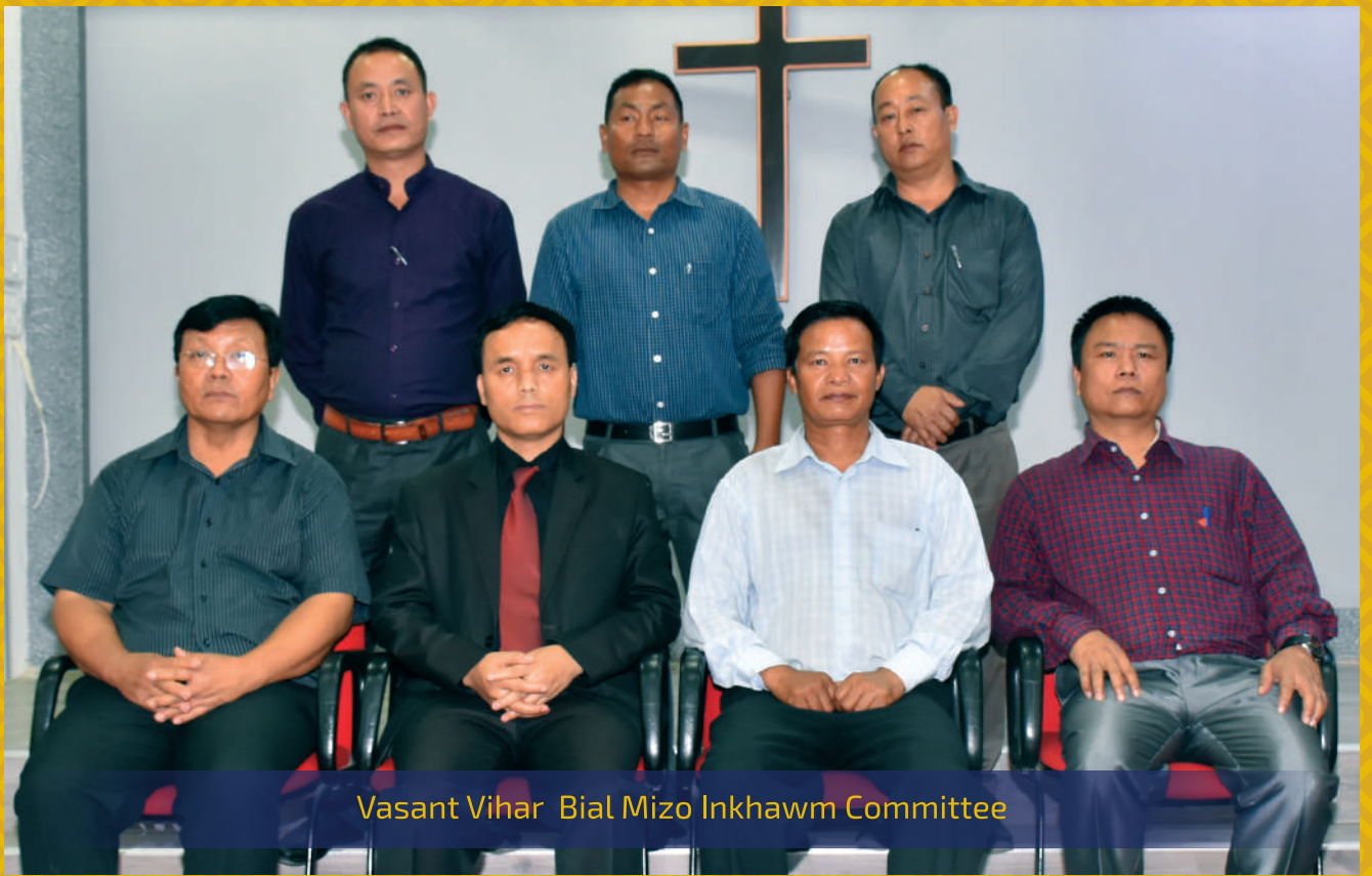
Vasant Vihar Bial Mizo Inkhawm Committee