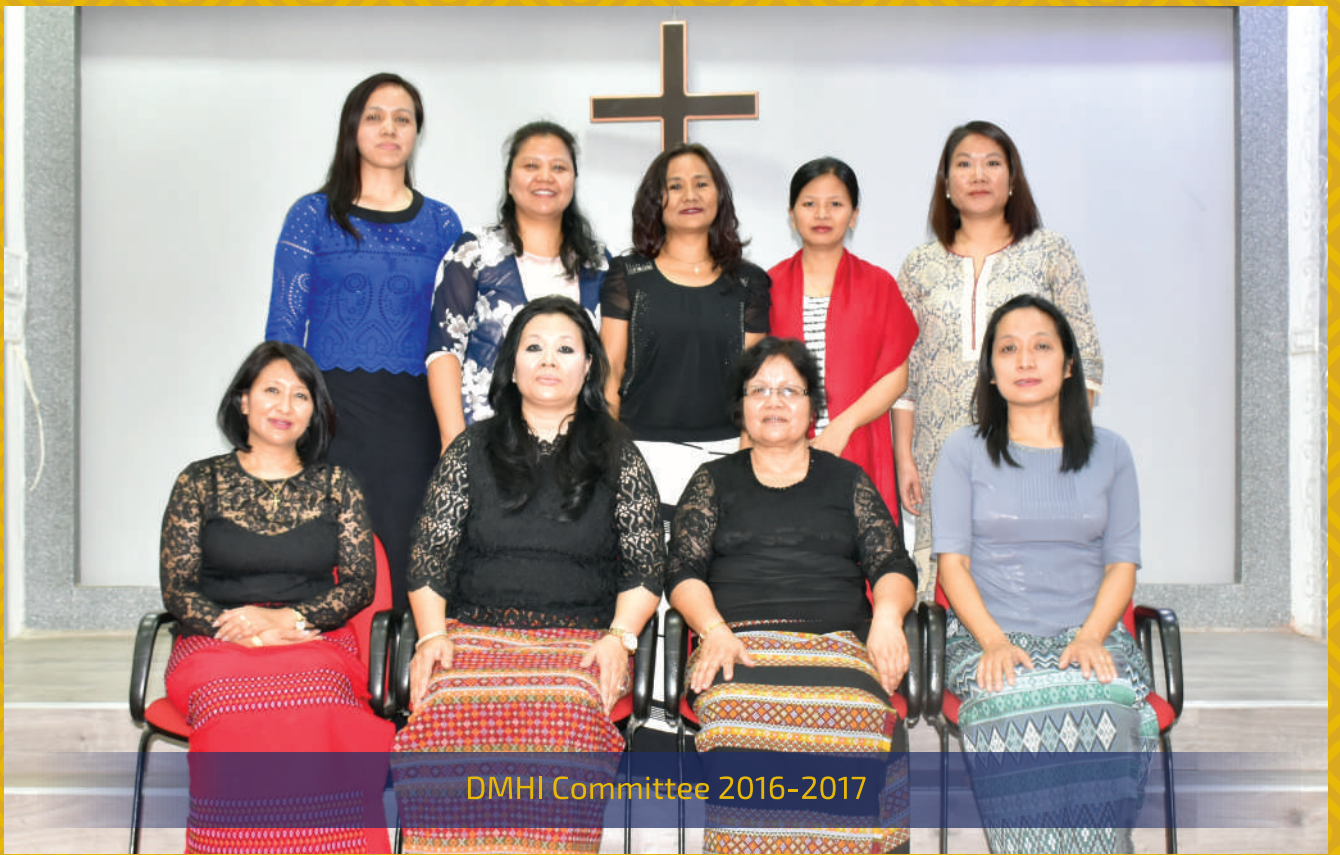
DMHI Committee 2016-2017