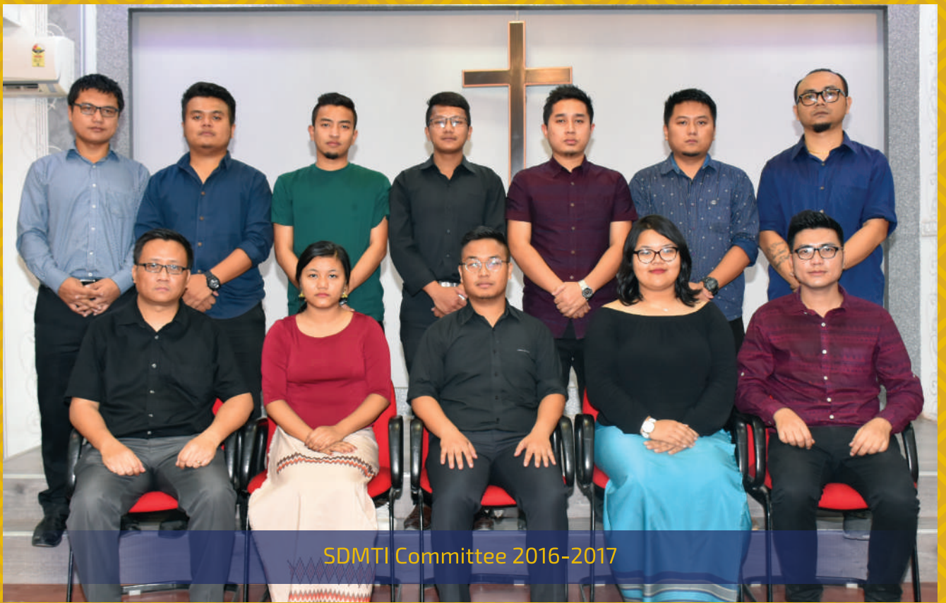
SDMTI Committee 2016-2017