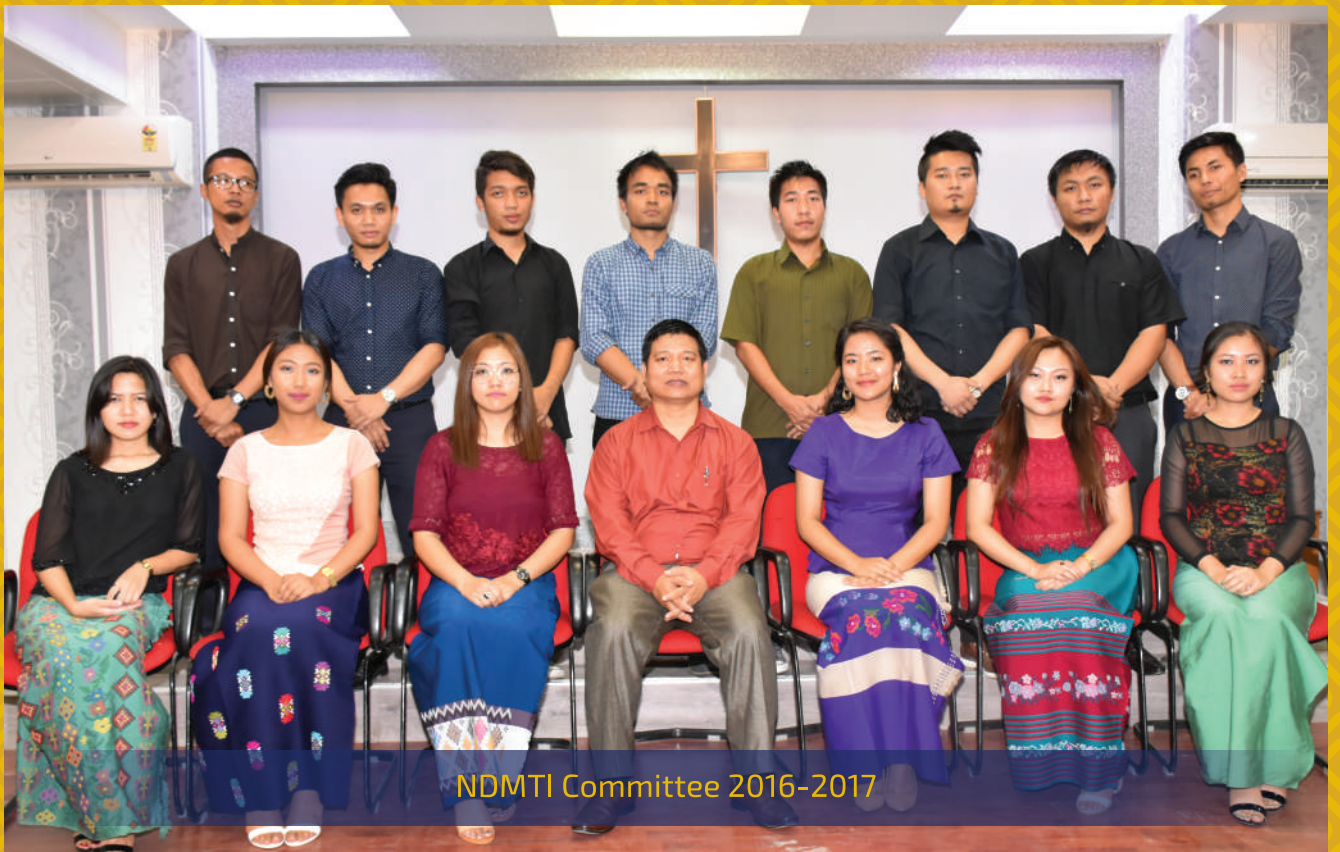
NDMTI Committee 2016-2017