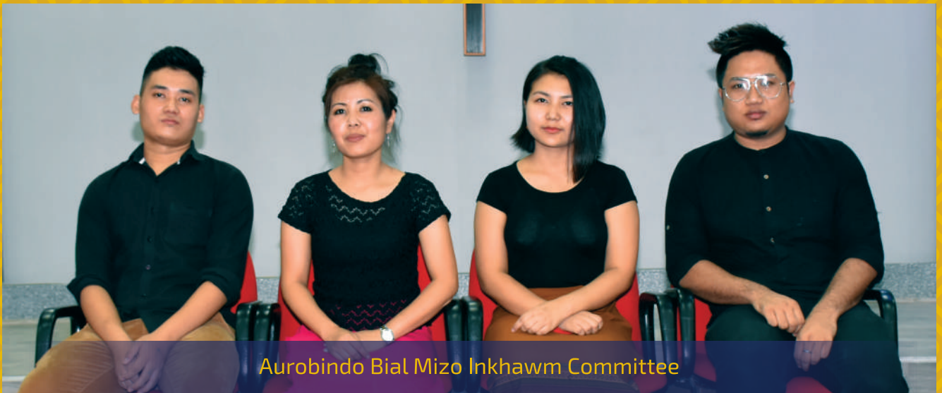
Aurobindo Bial Mizo Inkhawm Committee