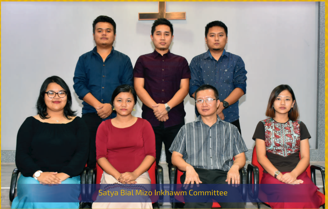
Satya Bial Mizo Inkhawm Committee