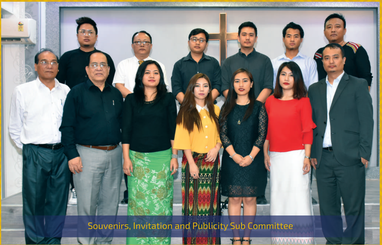
Souvenirs, Invitation and Publicity Sub Committee