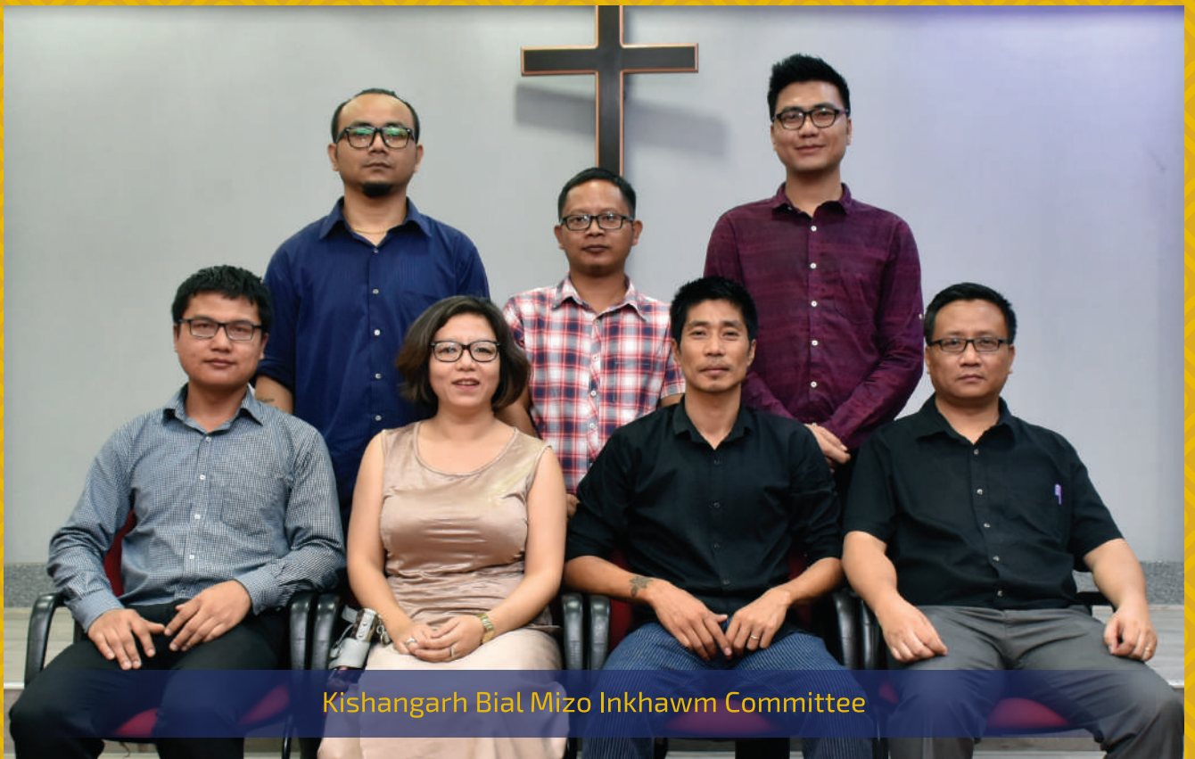
Kishangarh Bial Mizo Inkhawm Committee