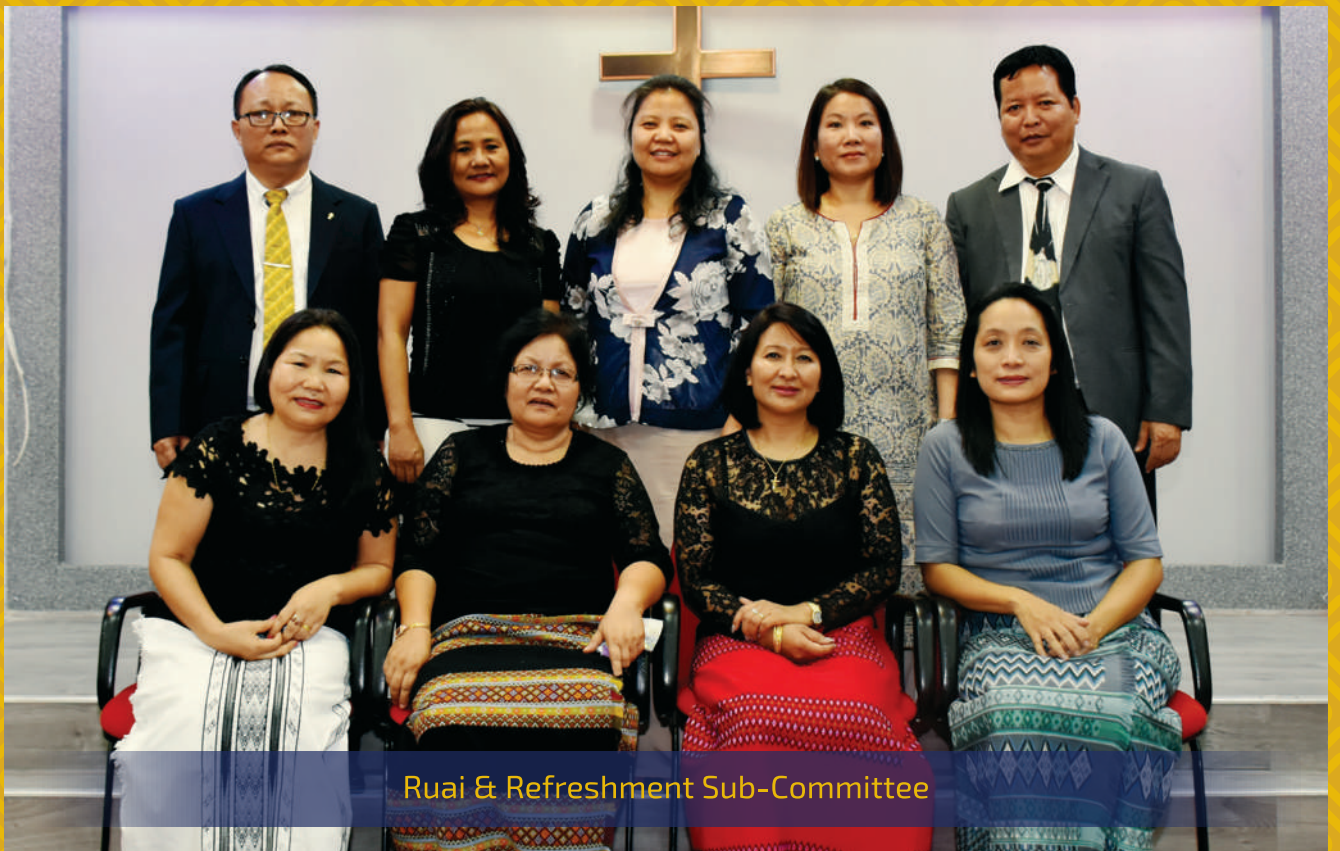
Ruai & Refreshment Sub-Committee