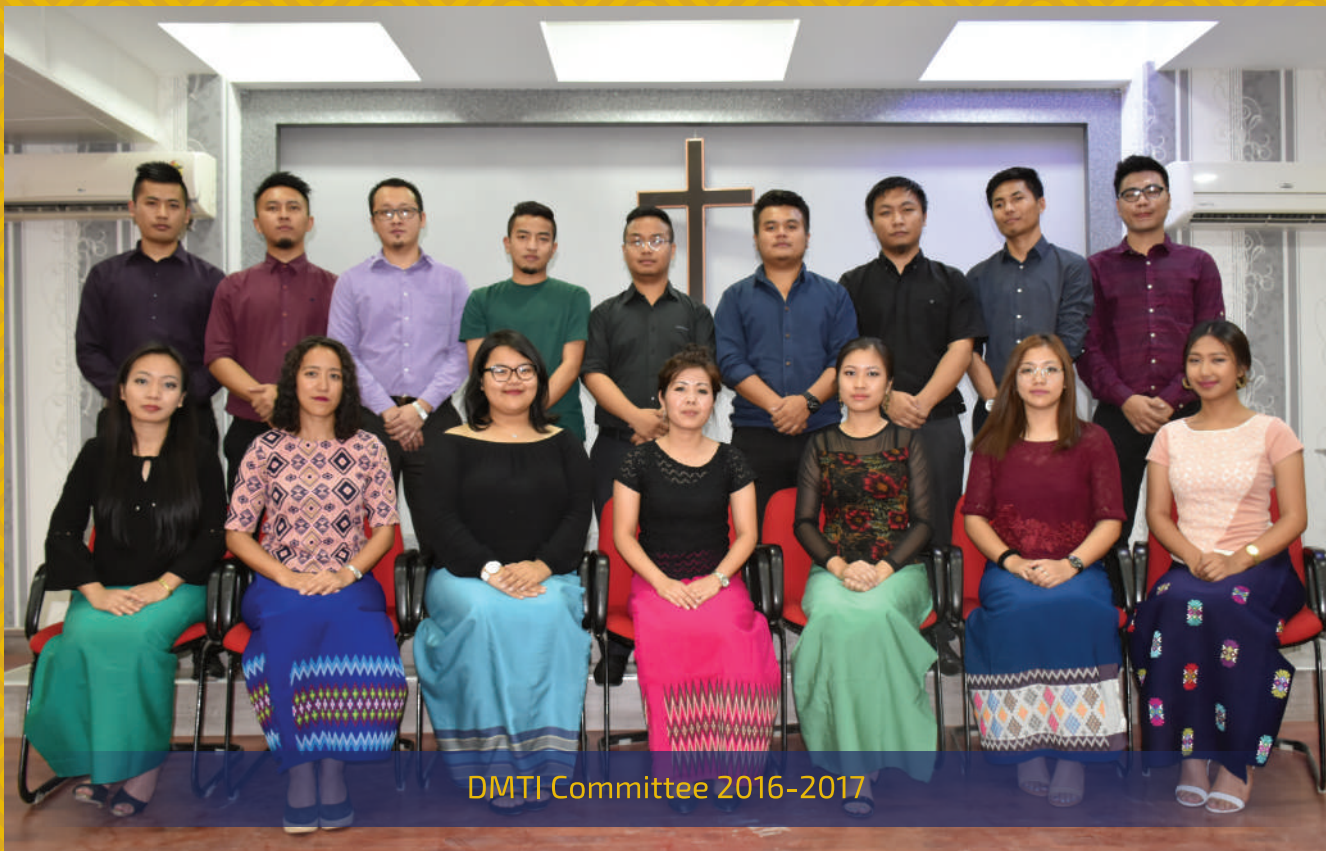
DMTI Committee 2016-2017