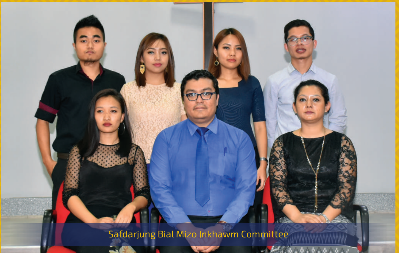
Safdarjung Bial Mizo Inkhawm Committee