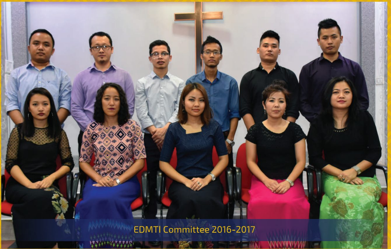
EDMTI Committee 2016-2017