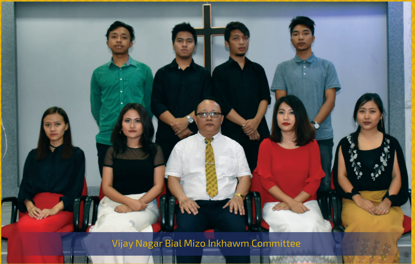
Vijay Nagar Bial Mizo Inkhawm Committee